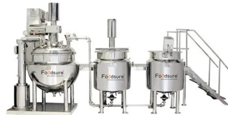
Pickle Processing Plant