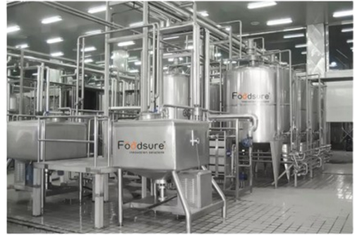
Tomato Puree Processing Plant