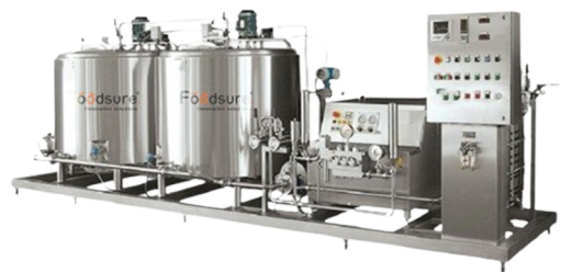
Non Dairy Whipped Cream Plant