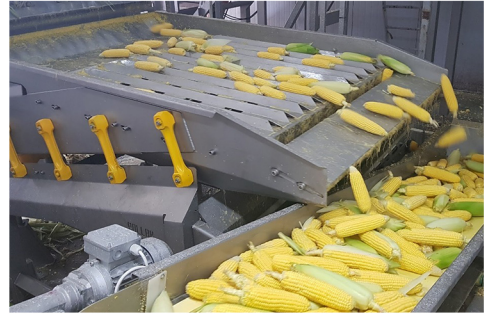
Sweet Corn Canning Processing Plant