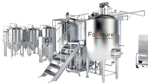
Tomato Ketchup & Sauce Processing Plant