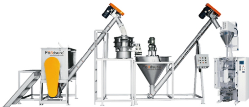
Protein Mix Processing Plant