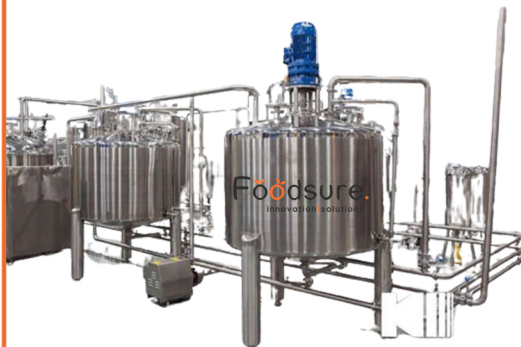
Beverage Processing Plant