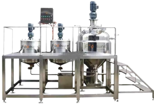
Mayonnaise Processing Plant