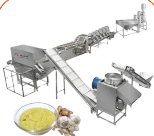
Ginger & Garlic Paste Processing Plant