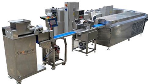
Energy Bar Plant