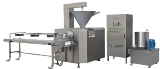
Protein Bar Processing Plant